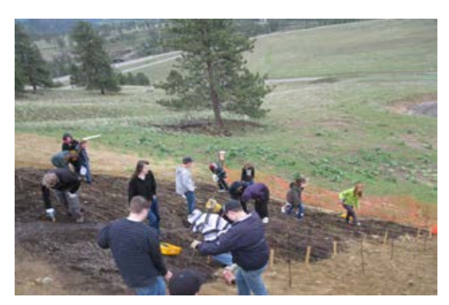
Figure 4: An example of fieldwork in the community, where a student restored a grassland for their course project with the help of his community members at a site damaged by construction when installing a water reservoir as part of a water upgrade in Princeton, British Columbia

Solution: Assignments include scaffolded projects, where students build their final project from smaller assignments throughout the course, peer review, where students critique each other's project proposals, and in the Restoration Ecology course, an exercise called Show Me the Money. In Show Me the Money, students pitched their projects to the rest of the class for funding. The class is identified as the funding agency and has $50,000 to distribute. Each member of the class has a vote in deciding which project will be fully funded.