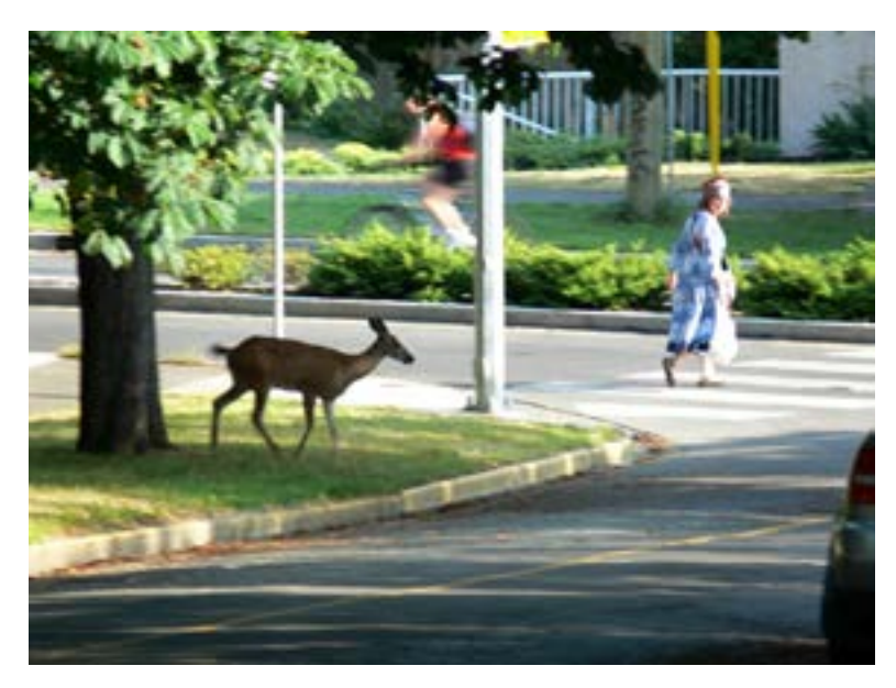
Figure 2: Restoration projects in cities may increase deer populations or alternatively deer may be attracted to restored areas and graze on the plants. Resolving these conflicts requires applying critical-thinking skills