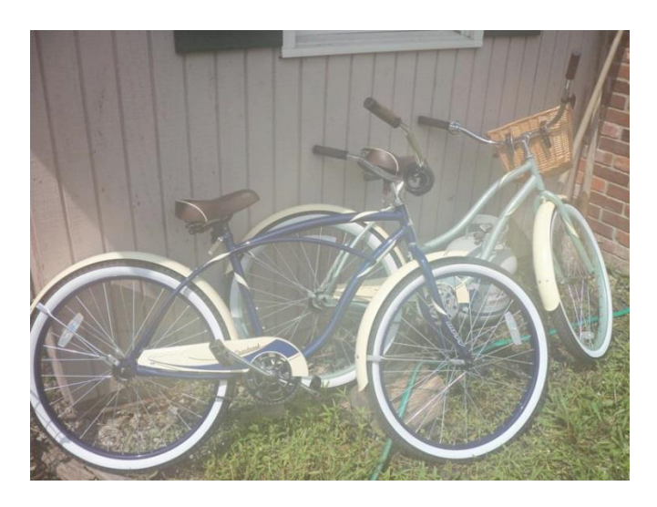
Figure 6. Family bicycles. "In the weekends, that's where we got the bicycles and we started getting out and walking at the lake or take the bikes out and things like that."

All of these themes can be found directly in the photographs. Theme 1: "Changes over time" can be seen in photos of all the different blood testing kits, insulin pumps, and supplies that did not