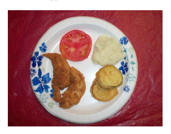
Figure 4. Dinner. "That's probably one of the biggest changes, is your diet. I love to eat. I always did. So I've got to be more careful and a lot of the times I've found out that you can proportion some things and vegetables, I eat more vegetables then I used to."