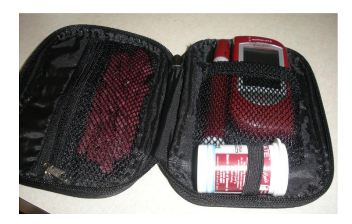
Figure 1. Glucose monitor.

Photos were taken using a digital camera during the course of a typical weekday and on a second day if needed (a weekend or non-typical day). In the past, researchers commonly gave disposable cameras to their participants. This required researchers to spend time and money developing the photographs. Digital cameras, including those in cell phones, are easy and portable, and they allow the user to take and share photographs with ease. Saving time by not having to deliver the cameras and develop the film was an important issue in trying to complete a research project over a 16-week semester course. Digital cameras also allowed the participants to review the pictures taken and delete any they did not want to share.