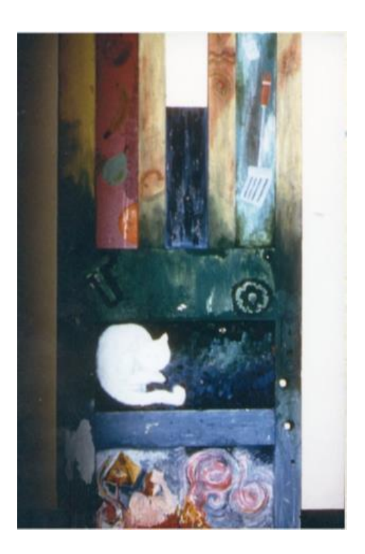
Figure 2. Group project of carved and painted door, Youth Arts Archive 1988-89.

Colin had grabbed the door off the top of a skip full of rubbish on the pavement of a dirty inner city street, together with a curved metal chair. Presumably it had come out of a house that was being demolished, and he had brought it into the youth center across the road from the (supposedly) sterile hospital precinct. The paneled door was carved and painted in acrylics by a small group of young people collaborating with Colin. They painted the upper part with domestic objects from everyday life, perhaps things that young people in hospital missed from home—fresh fruit, and their pet cat placed in pride of place in the middle. The egg slice might be a reminder of ordinary domestic life, making your own breakfast, far from the hospitalized lives of the young painters.