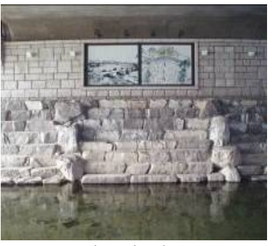
Under a bridge at Cheonggyecheon Stream.

Large natural stepping stones bridged the stream at intervals and people were crossing on them. Reflections showed natural vs. industrial. The light is softer, muted, down near the stream.