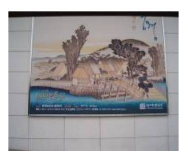
Mural on streamside at Cheonggyecheon