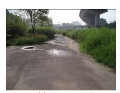
Ephemeral features on pathway at Cheonggyecheon Stream.