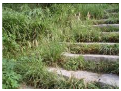
Steps from Cheonggyecheon stream to the city above with grasses