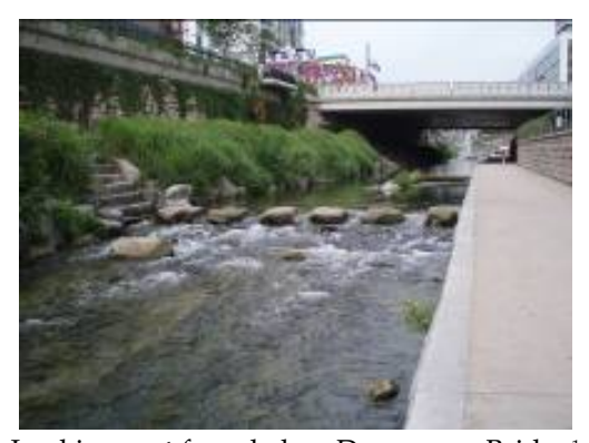
Looking east from below Dasangayo Bridge<sup>1</sup>

Peering down from, what I now know to be Dasangyo Bridge, a surprising view opened up and I suspected and hoped I had stumbled upon Cheonggyecheon Stream. A waterway below stretched in both directions from the bridge like a thread through the grey urbanlandscape. The green plantings framing the stream offered a coolness of colour in contrast to the pounding heat on the footpath. Stepping down the steep stairway towards the water was like sliding into a different world a more natural space where the senses are stimulated and the body begins to relax. An unhurried mood, Relief from the bustle and noise of a city in motion on the streets above.