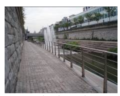
Paved pathway along Cheonggyecheon Stream.