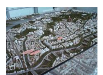
Scale model of the stream restoration photographed at Cheongyyecheon Museum

A wide range of texts, designed to inform, are positioned from one end of the stream to the other. These became my second teachers, the provocateurs driving the learning—the curriculum—facilitating currere.